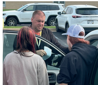
Drivers Education is offered at Ripon High School.