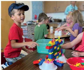
Barlow Park Elementary students build Dinosaur Houses.